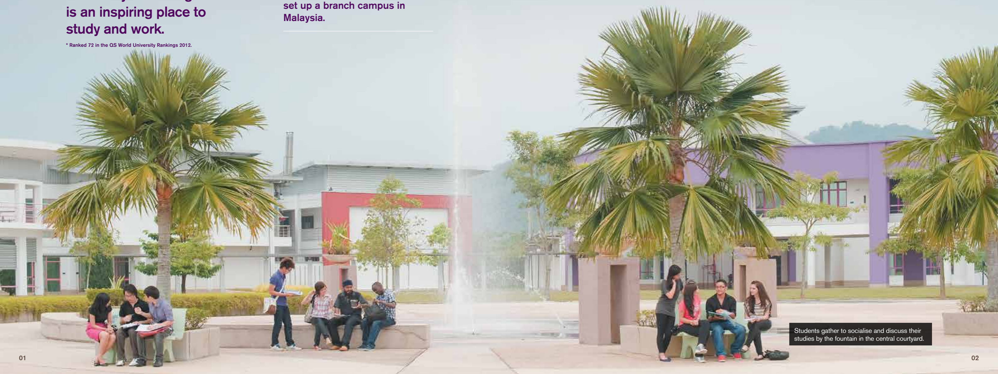
Students gather to socialise and discuss their studies by the fountain in the central courtyard.

* Alumni from our UK, China and Malaysia Campuses.